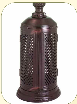
Close up detail base