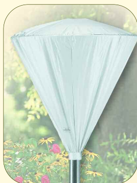
Hood Cover (Optional Accessories)

Please note: We have made every effort to make our heaters as safe, easy to assemble, and durable as possible. However, improper use, installation, adjustment, alteration, or maintenance of heater can cause property damage, injury, or possibly death. Please read instruction manual thoroughly before using, installing, or repairing this product. Please contact us if you have any questions whatsoever about the safe operation of this product. Due to our ongoing commitment to product improvement, prices, specifications, and materials subject to change without prior notice.