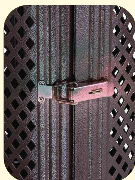
Heavy duty latch