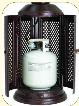
Tank in enclosure (tank not include)